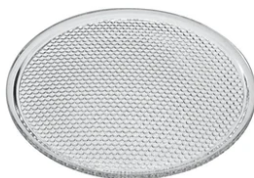
Flood lens 08.8175.68