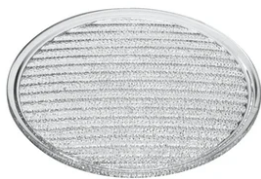
Elliptical lens 08.8163.68