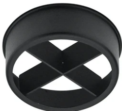
Holding ring 08.8410.00