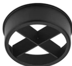
Screening crosspiece 08.8429.00