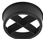
Screening crosspiece 08.8429.00