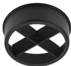
Screening crosspiece 08.8429.00