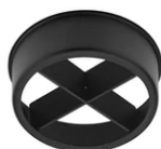
Screening crosspiece 08.8429.00