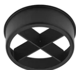
Screening crosspiece 08.8429.00