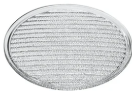
Elliptical lens 08.8163.68