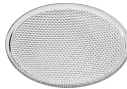
Flood lens 08.8175.68