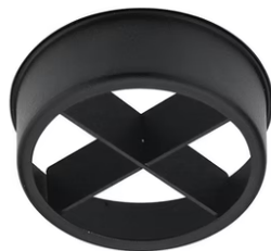
Screening crosspiece 08.8411.00