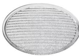
Elliptical lens 08.8163.68