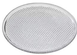
Flood lens 08.8175.68