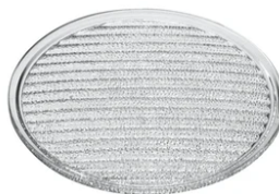
Elliptical lens 08.8163.68