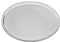
Flood lens 08.8175.68