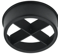
Screening crosspiece 08.8411.00