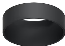
Screening crosspiece 08.8411.00