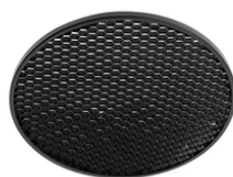
Flood lens 08.8175.68