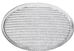
Flood lens 08.8175.68