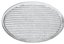
Elliptical lens 08.8163.68