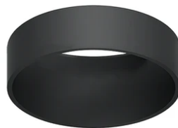
Holding ring 08.8410.00