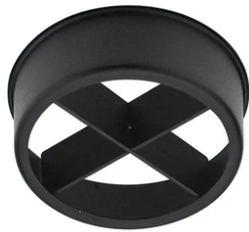
Screening crosspiece 08.8411.00