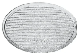
Elliptical lens 08.8163.68