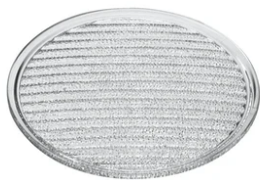
Elliptical lens 08.8163.68