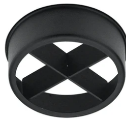
Screening crosspiece 08.8411.00