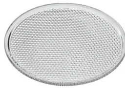
Flood lens 08.8175.68