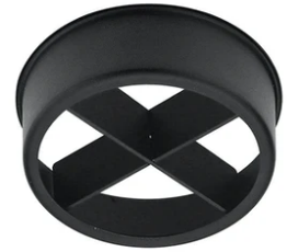
Screening crosspiece 08.8411.00