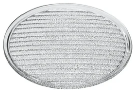
Elliptical lens 08.8163.68