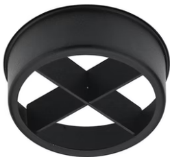
Holding ring 08.8410.00