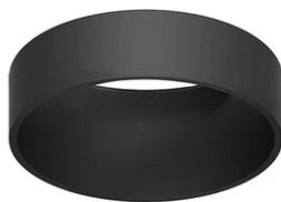
Holding ring 08.8410.00