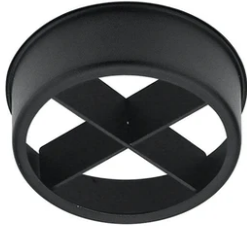
Screening crosspiece 08.8411.00