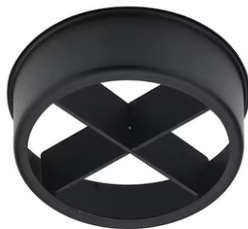
Holding ring 08.8410.00