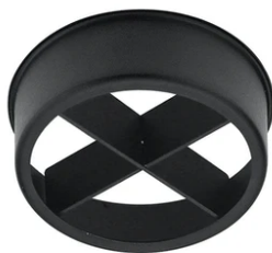
Holding ring 08.8410.00