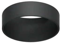
Holding ring 08.8410.00