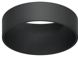
Holding ring 08.8410.00