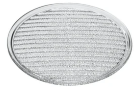
Elliptical lens 08.8163.68