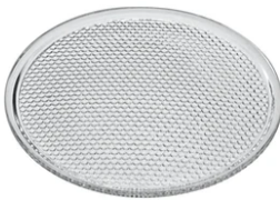
Flood lens 08.8175.68