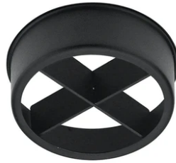
Screening crosspiece 08.8411.00