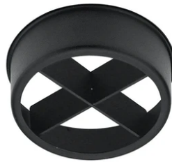
Screening crosspiece 08.8411.00