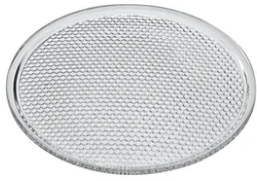
Flood lens 08.8175.68