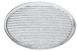
Elliptical lens 08.8163.68