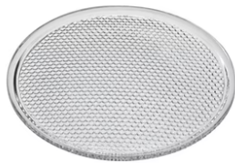
Flood lens 08.8175.68