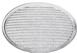
Elliptical lens 08.8163.68