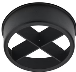
Screening crosspiece 08.8411.00