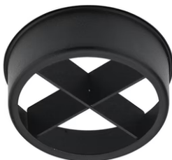
Elliptical lens 08.8163.68