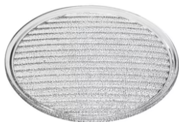
Holding ring 08.8410.00