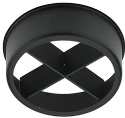
Screening crosspiece 08.8411.00