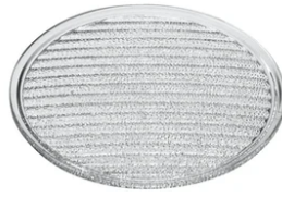
Elliptical lens 08.8163.68