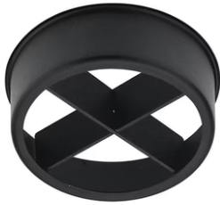
Screening crosspiece 08.8411.00