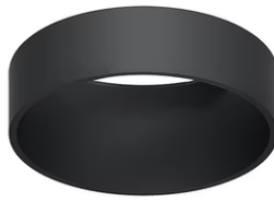
Holding ring 08.8410.00