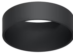
Holding ring 08.8410.00