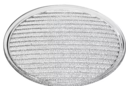
Elliptical lens 08.8163.68