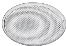
Flood lens 08.8175.68