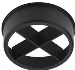
Screening crosspiece 08.8411.00