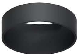
Holding ring 08.8410.00