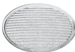
Elliptical lens 08.8163.68