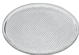
Flood lens 08.8175.68