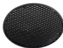
Flood lens 08.8175.68