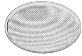
Flood lens 08.8175.68