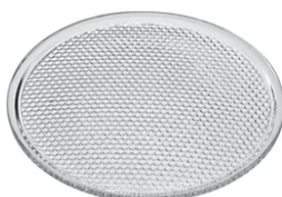
Flood lens 08.8175.68