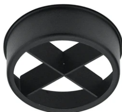
Screening crosspiece 08.8411.00