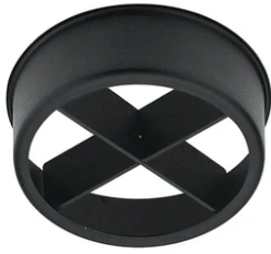
Screening crosspiece 08.8411.00