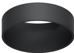
Screening crosspiece 08.8411.00