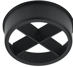
Screening crosspiece 08.8411.00