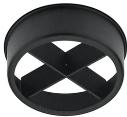
Screening crosspiece 08.8411.00