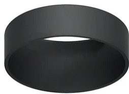
Holding ring 08.8410.00