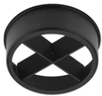
Screening crosspiece 08.8429.00