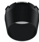
Snoot shielding cone 08.0526.00