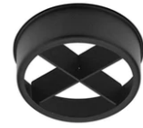
Screening crosspiece 08.8429.00