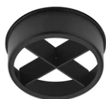
Screening crosspiece 08.8429.00