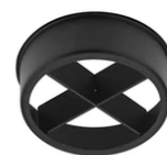
Screening crosspiece 08.8429.00