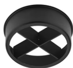
Screening crosspiece 08.8429.00