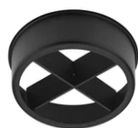
Screening crosspiece 08.8429.00