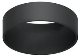
Holding ring 08.8410.00