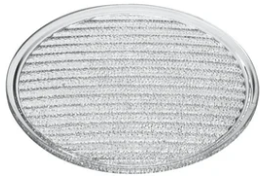
Elliptical lens 08.8163.68