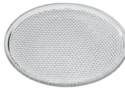
Flood lens 08.8175.68