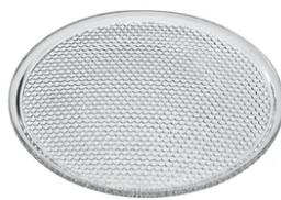
Flood lens 08.8175.68