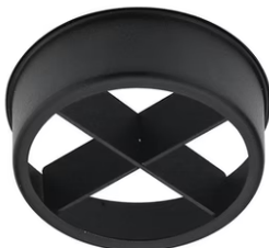
Holding ring 08.8410.00