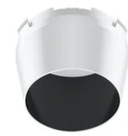
Snoot shielding cone 08.0526.BW